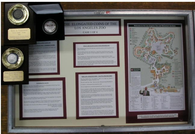
Oded's winning exhibit (first case of four) with the three awards it won!